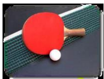
Table tennis returns to the parish. It is proposed to hold this on Sunday afternoons, our first gathering on Sunday 15th from 3pm to 4.30pm in Abbeystrewry Hall. Tea and Coffee will be served!

Confirmation ~ If you are interested in being confirmed next year (2024), please let the rector know. Attendance at the Diocesan confirmation morning in Douglas is compulsory, as are attendance at confirmation classes. After the disruption of Covid 19, we have now returned to our policy of confirmation in the parish every two years. So after 2024, the next confirmation will be 2026! Please note that the rector is not responsible for the date of the confirmation which is set by the Bishop.